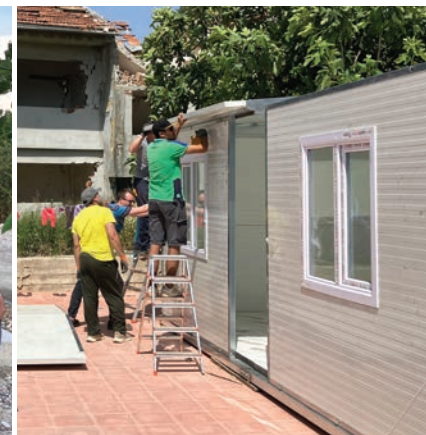
Above: A relief team gathers for prayer before pitching tents for the homeless; A grateful family poses with relief workers in front of their new modular house; In the earthquake zone, new modular homes sit next to ruined buildings awaiting demolition.