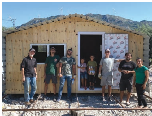
Above: A team completes a tiny wooden home for a family in need.

Recognizing the need for additional temporary homes, we approached a believer who runs a metal shop about building collapsible containers.