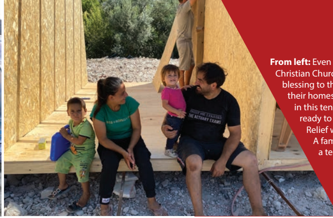
From left: Even in its half-finished form, Antakya Christian Church's new building has been a blessing to the relief efforts; Many who lost their homes in Iskenderun, Turkey, now live in this tent city; This modular house is ready to be transported and then set up; Relief workers help an extended family; A family sits inside the tiny home that a team is building for them.

plan to use this plot of land to continue their relief efforts and eventually establish a church with their many contacts.